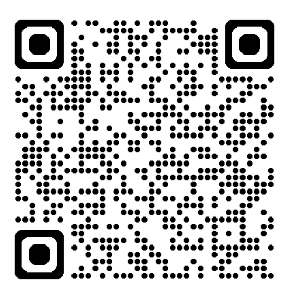
TSALC FB Link You will have to answer 3 simple questions