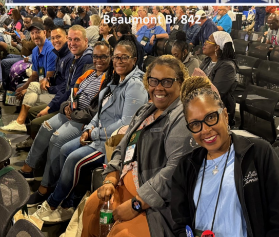
Beaumont Br 842